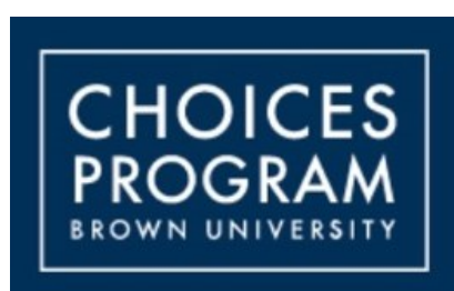
Figure 3: Choices Program logo

Having also been told that the Choices Program is part of Brown University’s history department, these school districts may be far less alert to contractual language suggesting that Brown University is the agent of another interested party, and they may have foregone the same level of diligence reserved for typical vendors because of Brown University’s reputation and credibility. This raises a host of problems for the trustees of boards of education bound by fiduciary duties and a legal responsibility for curriculum and contract approvals, as they cannot effectively carry out their duties if they are prevented from identifying all the parties behind their contracts. School district administrators recommending the Choices Program to their boards of education on the inherent credibility and strength of a program “owned by” an elite university, may be equally misled. The subscription agreement never states that Brown University actually owns any of the content that it licenses to schools via the Choices Program subscription, but rather represents that Brown University has the rights and has obtained permission from unnamed third parties to license it: